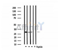
Western blot analysis of extracts from 293 and rat brain mouse lung, using 14-3-3 ? Ab.

Storage: Rabbit IgG in phosphate buffered saline, pH 7.4, 150mM NaCl, 0.02% sodium azide and 50% glycerol. Store at -20 °C. Stable for 12 months from date of receipt.