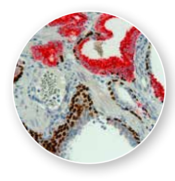
PIN Cocktail (p63 + P504S; C0001K) staining on prostate carcinoma